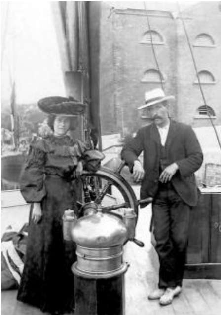
The Old Rigby Granary about 1905. The Skipper and his wife aboard The Reliance.

Website – https://www.mistleyparishcouncil.gov.uk