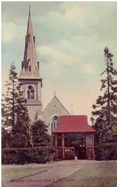
St Mary and St Michael's Church.