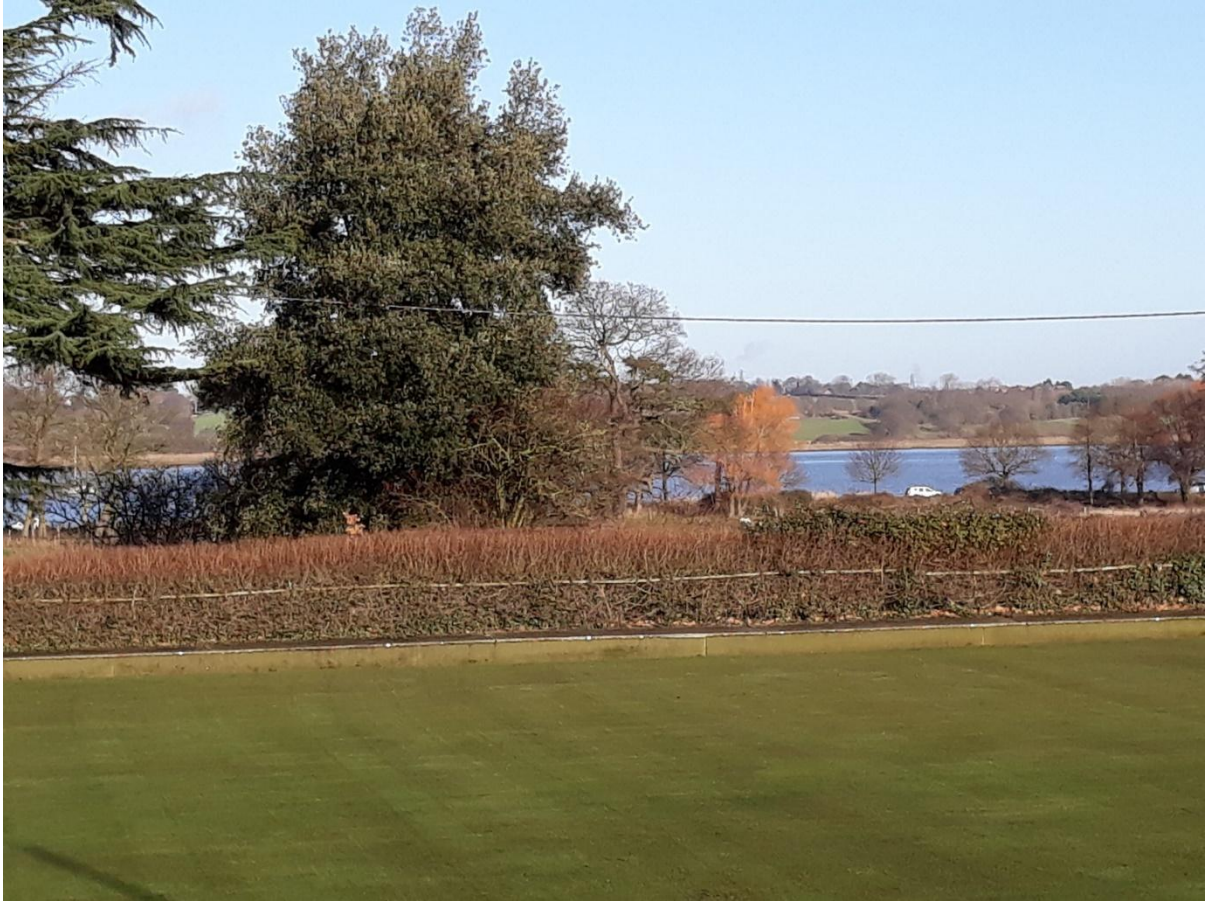
Mistley Bowls Club.