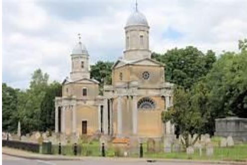
The historic Mistley Towers.