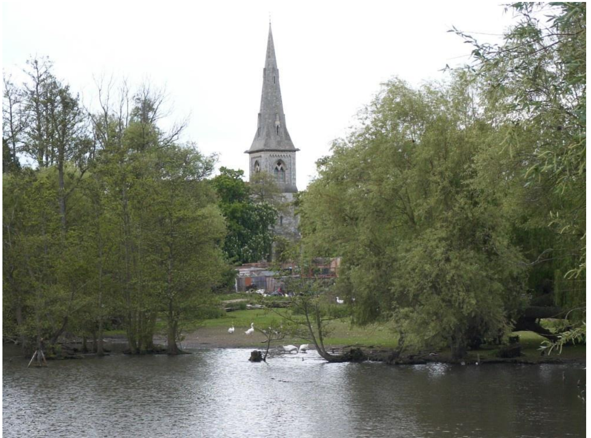
St Mary and St Michael's Church.

The Cemetery – The Cemetery is looked after and maintained by Mistley Parish Council. The Parish Council maintains and pays for the Cemetery and the grounds maintenance at the Closed Churchyard. The Parish Council has a contract with a Cemetery Manager – Gwinnell's Funeral Directors, Manningtree. The Finance Committee makes recommendations to the Parish Council about the regulations, fees charged and rules and in accordance with the latest legislation. Vehicular access is by Church Lane and there is also a pedestrian access through the Burial Ground of St Mary and St Michael's Church.