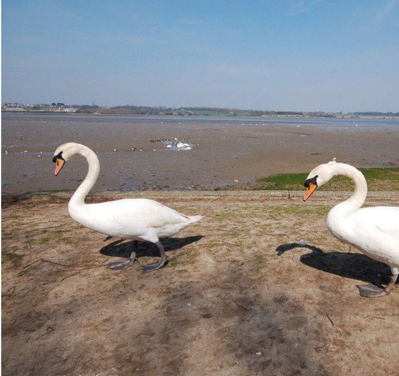
The Swans along The Walls.

Welcome to the Community Action/Business Plan of Mistley Parish Council. The Council has decided to adopt a more business-like approach, whilst endeavouring to engage more fully with the local community. This document provides the Council's Vision for the next three years, with a review each year. The Plan is an evolving community document.