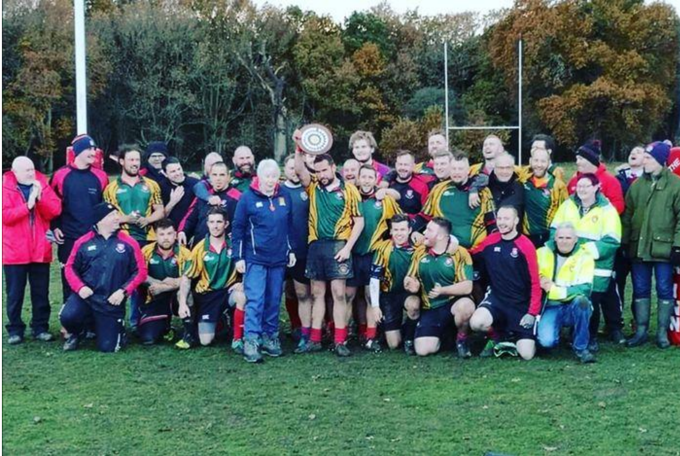
Mistley Rugby Club.

Ramsey and Mistley Football Club – The Club was originally formed in 2003. It started off with nothing more than two footballs and a set of goals bought on EBay for £100! The Club has had a few names changes since it started. The Club now has two facilities - The original home of Ramsey and also a Clubhouse with a second pitch at Mistley. A ladies team entered the league in 2019.