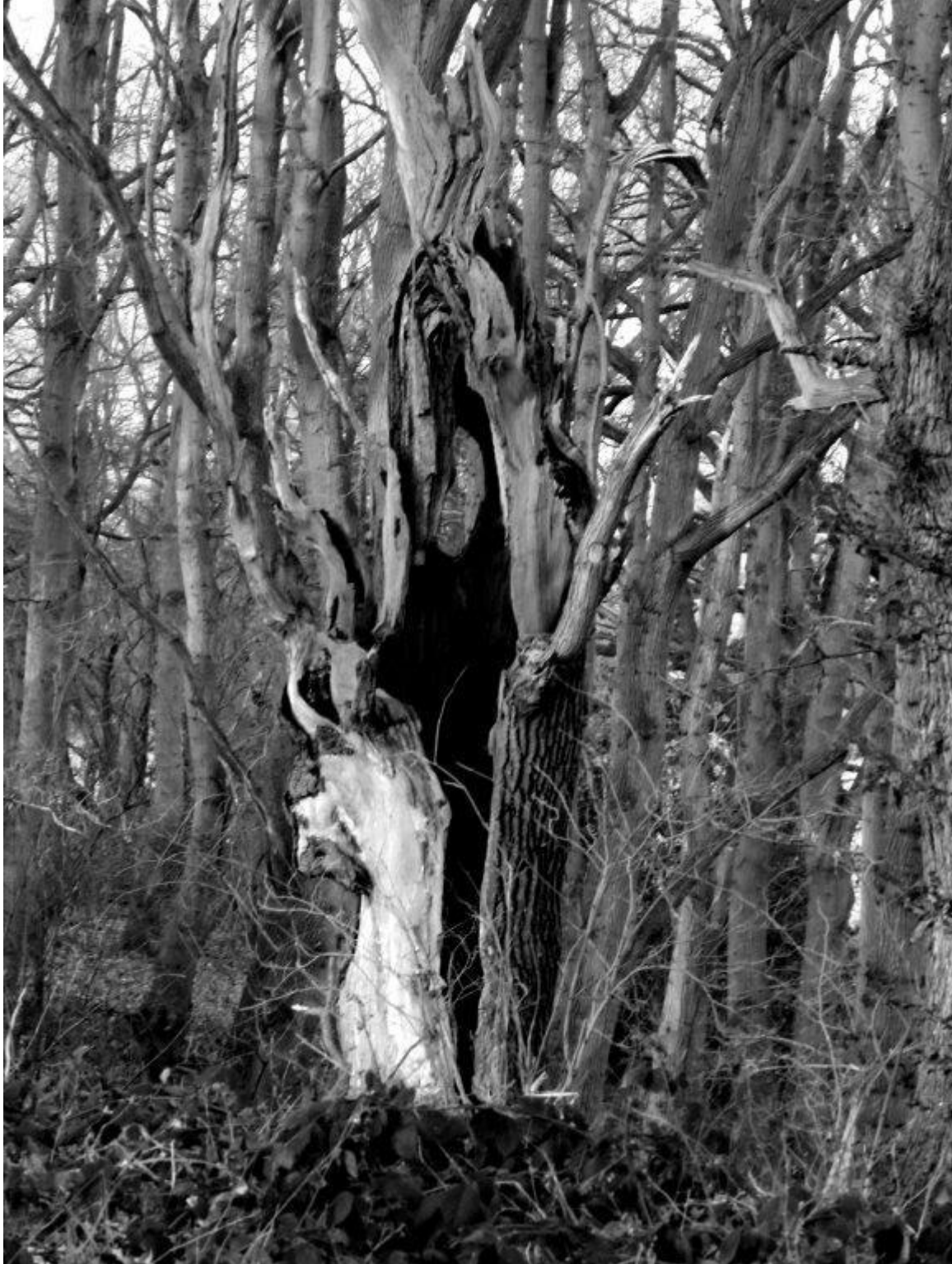
The famous and much loved Old Knobbly – a veteran Oak Tree at Furze Hill Woods