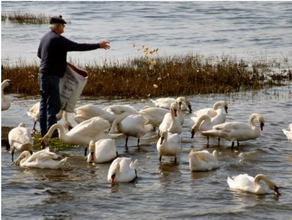
Feeding time for the Swans.

Play Area – The Welcome Home Field – The Trust (Parish Council is sole Trustee) maintains the play equipment, seats, bins and open playing field in this area for all to enjoy.