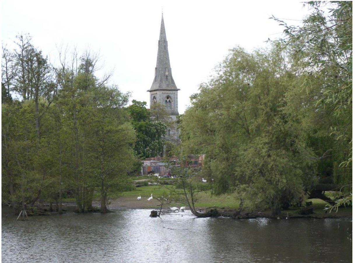
St Mary and St Michael's Church.

The Cemetery – The Cemetery is looked after and maintained by Mistley Parish Council. The Parish Council maintains and pays for the Cemetery and the grounds maintenance at the Closed Churchyard. The Parish Council has a contract with a Cemetery Manager – Gwinnell's Funeral Directors, Manningtree. The Finance Committee makes recommendations to the Parish Council about the regulations, fees charged and rules and in accordance with the latest legislation. Vehicular access is by Church Lane and there is also a pedestrian access through the Burial Ground of St Mary and St Michael's Church.