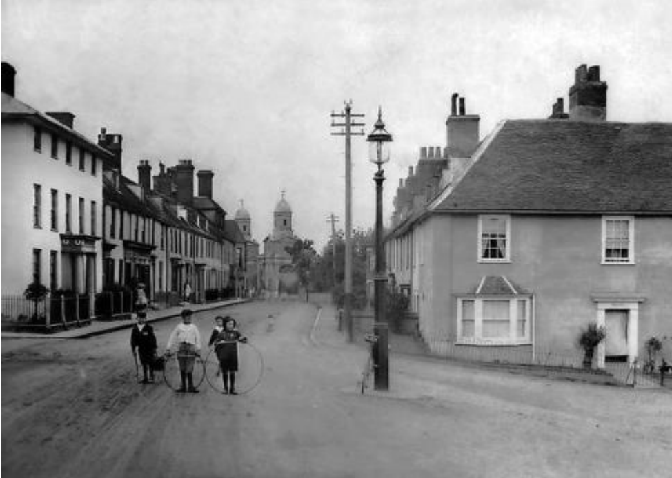
Old Mistley with the wonderful Mistley Towers in the background – about 1900.