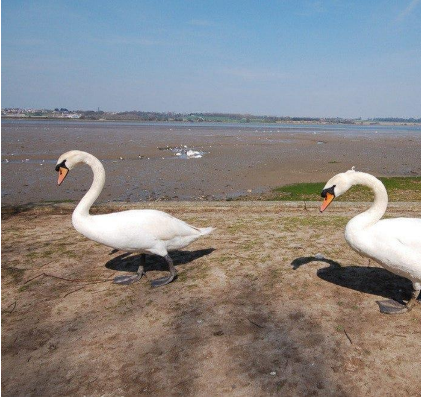
The Swans along The Walls.