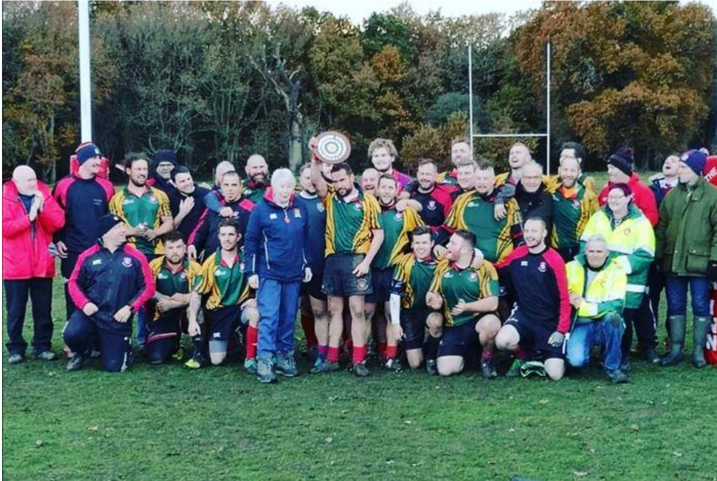
Mistley Rugby Club.

Ramsey and Mistley Football Club – The Club was originally formed in 2003. It started off with nothing more than two footballs and a set of goals bought on EBay for £100! The Club has had a few names changes since it started. The Club now has two facilities - The original home of Ramsey and also a Clubhouse with a second pitch at Mistley. A ladies team entered the league in 2019.