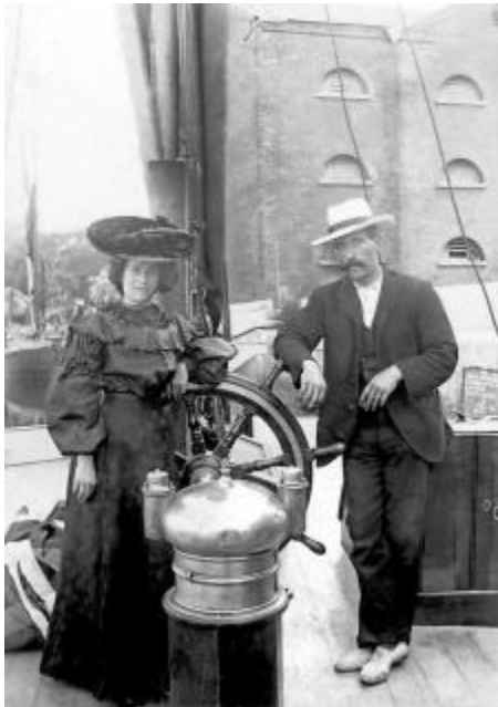
The Old Rigby Granary about 1905. The Skipper and his wife aboard The Reliance.

Website – https://www.mistleyparishcouncil.gov.uk