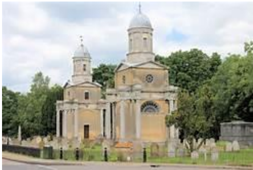
The historic Mistley Towers.