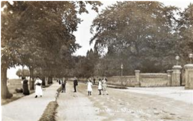
The Walls, Old Mistley.