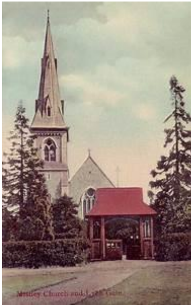
St Mary and St Michael's Church.