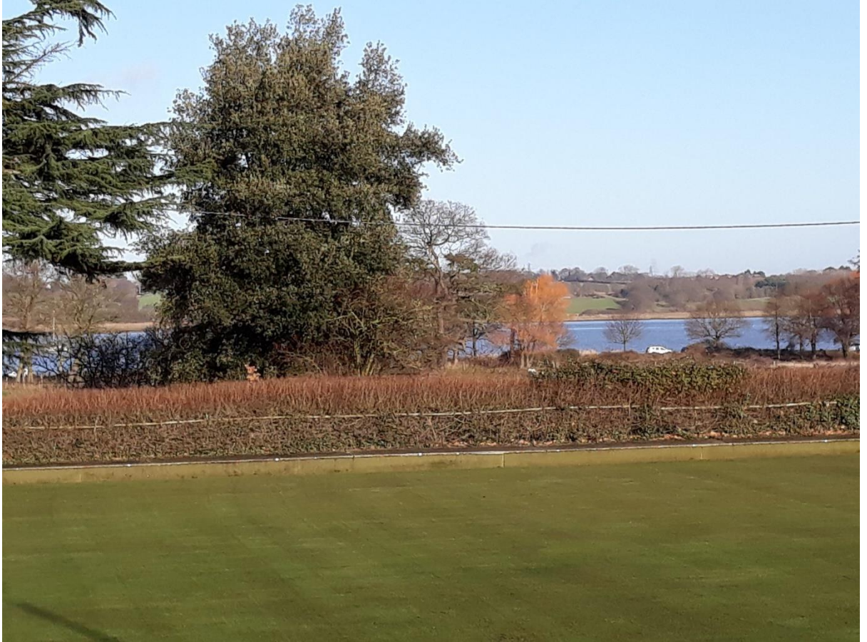
Mistley Bowls Club.