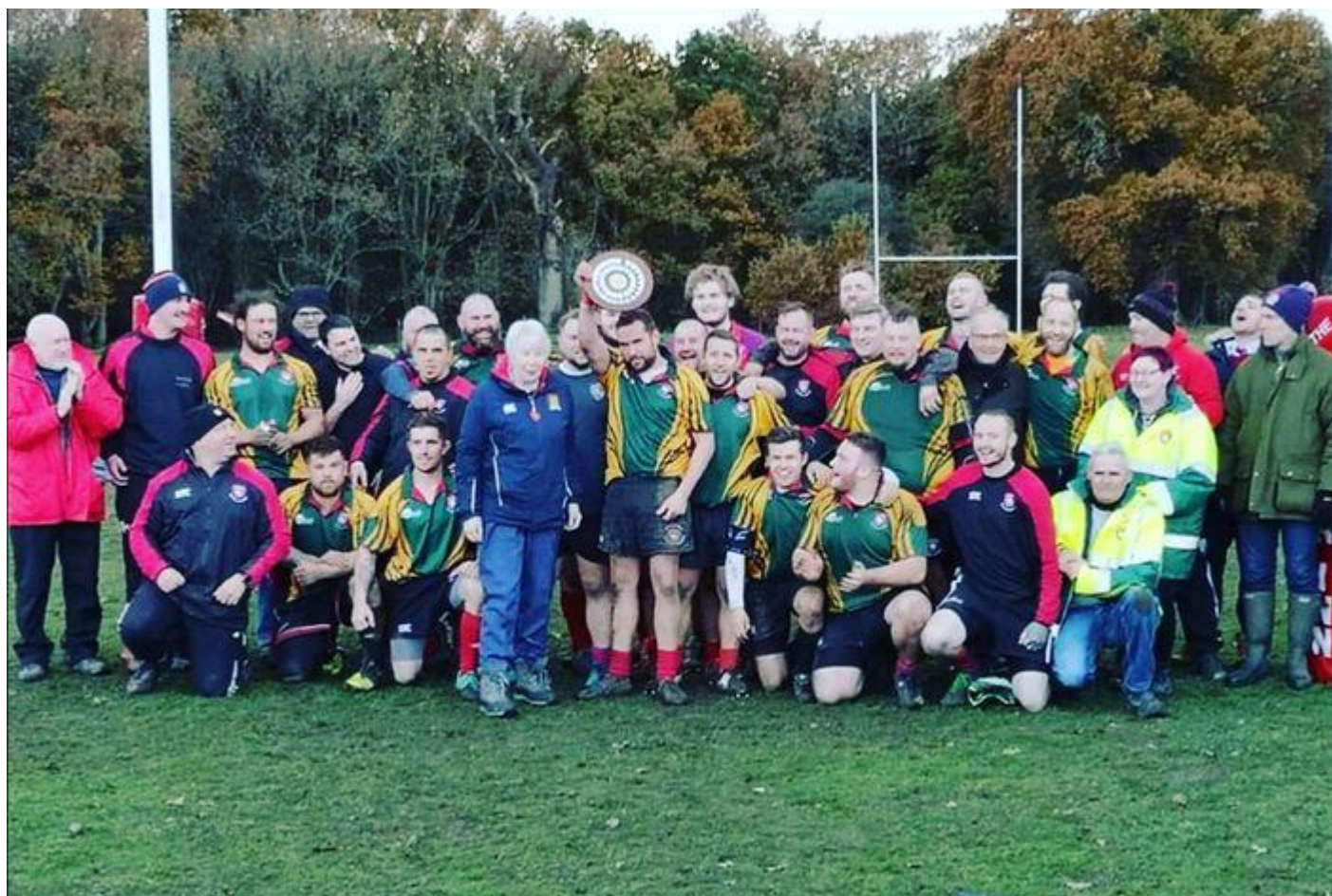
Mistley Rugby Club.

Ramsey and Mistley Football Club – The Club was originally formed in 2003. It started off with nothing more than two footballs and a set of goals bought on EBay for £100! The Club has had a few names changes since it started. The Club now has two facilities - The original home of Ramsey and also a Clubhouse with a second pitch at Mistley. A ladies team entered the league in 2019.