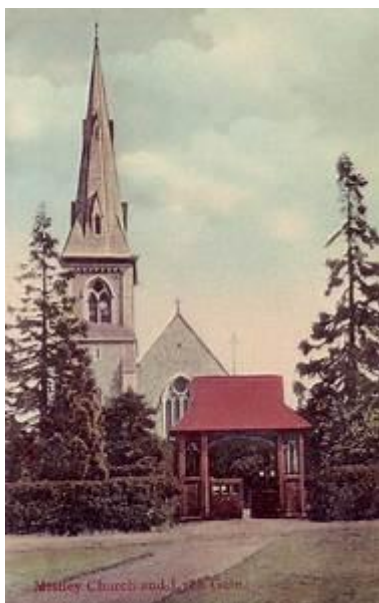
St Mary and St Michael's Church.