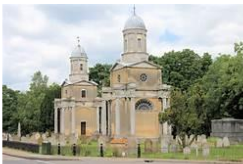
The historic Mistley Towers.